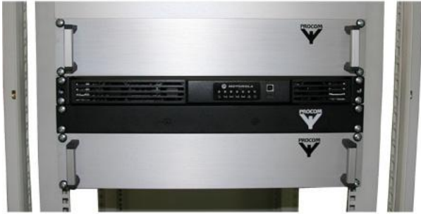
Can be placed above or below the repeater.