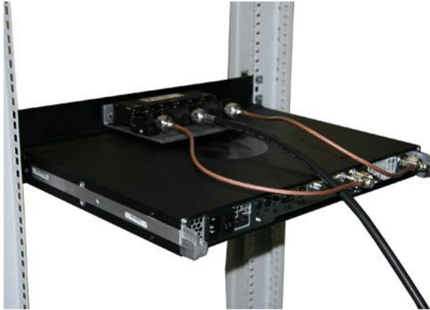
TX and RX cables can be switched to high or low on the filter.