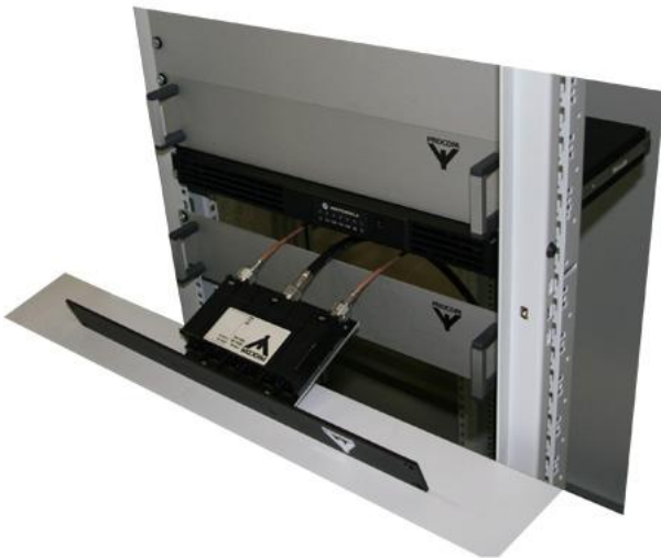
Cables can be switched from the front.