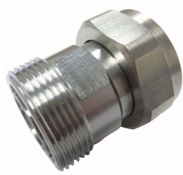
7-16 DIN Male to 7-16 DIN Female Low-PIM Adapter