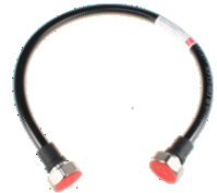
Picture shows 7M7FS12-0100FFP for illustration purpose

Radio Frequency Systems' CELLFLEX® Factory-Fit Jumpers feature specially designed connectors which are soldered-on in a strictly controlled industrial process to ensure industry leading performance for today's high-performance wireless systems. The connector design and manufacturing process has been optimized to produce premium VSWR and IM levels. Injection molded boots provide reliable and repeatable additional sealing level and strain relief. Our facilities produce and stock all popular lengths as required by the industry, and can deliver custom lengths with premium VSWR and IM levels on request.