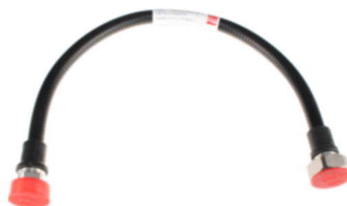
7M7MS12-0100FFP for EXAMPLE