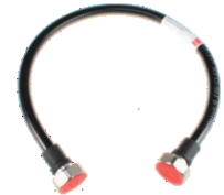
Picture shows 7M7FS12F-0100FFP for illustration purpose

Radio Frequency Systems' CELLFLEX® Factory-Fit Jumpers feature specially designed connectors which are soldered-on in a strictly controlled industrial process to ensure industry leading performance for today's high-performance wireless systems. The connector design and manufacturing process has been optimized to produce premium VSWR and IM levels. Injection molded boots provide reliable and repeatable additional sealing level and strain relief.