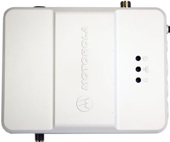
Motorola Repeater Unit