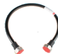
Picture shows 7M7ML12F-0100FFS for illustration purpose

Radio Frequency Systems' CELLFLEX® Factory-Fit Jumpers feature specially designed connectors which are soldered-on in a strictly controlled industrial process to ensure industry leading performance for today's high-performance wireless systems. The connector design and manufacturing process has been optimized to produce premium VSWR and IM levels. Injection molded boots provide reliable and repeatable additional sealing level and strain relief.