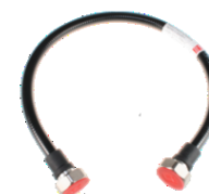
Picture shows 7M7FS12F-0100FFP for illustration purpose

Radio Frequency Systems' CELLFLEX® Factory-Fit Jumpers feature specially designed connectors which are soldered-on in a strictly controlled industrial process to ensure industry leading performance for today's high-performance wireless systems. The connector design and manufacturing process has been optimized to produce premium VSWR and IM levels. Injection molded boots provide reliable and repeatable additional sealing level and strain relief.