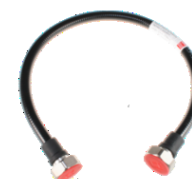
Picture shows 7M7ML12F-0100FFS for illustration purpose

Radio Frequency Systems' CELLFLEX® Factory-Fit Jumpers feature specially designed connectors which are soldered-on in a strictly controlled industrial process to ensure industry leading performance for today's high-performance wireless systems. The connector design and manufacturing process has been optimized to produce premium VSWR and IM levels. Injection molded boots provide reliable and repeatable additional sealing level and strain relief.