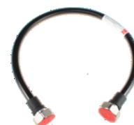
Picture shows 7M7ML12-0100FFP for illustration purpose

Radio Frequency Systems' CELLFLEX® Factory-Fit Jumpers feature specially designed connectors which are soldered-on in a strictly controlled industrial process to ensure industry leading performance for today's high-performance wireless systems. The connector design and manufacturing process has been optimized to produce premium VSWR and IM levels. Injection molded boots provide reliable and repeatable additional sealing level and strain relief. Our facilities produce and stock all popular lengths as required by the industry, and can deliver custom lengths with premium VSWR and IM levels on request.