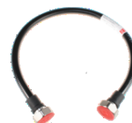
Picture shows 7M7FS12F-0100FFP for illustration purpose

Radio Frequency Systems' CELLFLEX® Factory-Fit Jumpers feature specially designed connectors which are soldered-on in a strictly controlled industrial process to ensure industry leading performance for today's high-performance wireless systems. The connector design and manufacturing process has been optimized to produce premium VSWR and IM levels. Injection molded boots provide reliable and repeatable additional sealing level and strain relief.