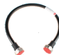
Picture shows 7M7FS12-0100FFP for illustration purpose

Radio Frequency Systems' CELLFLEX® Factory-Fit Jumpers feature specially designed connectors which are soldered-on in a strictly controlled industrial process to ensure industry leading performance for today's high-performance wireless systems. The connector design and manufacturing process has been optimized to produce premium VSWR and IM levels. Injection molded boots provide reliable and repeatable additional sealing level and strain relief. Our facilities produce and stock all popular lengths as required by the industry, and can deliver custom lengths with premium VSWR and IM levels on request.