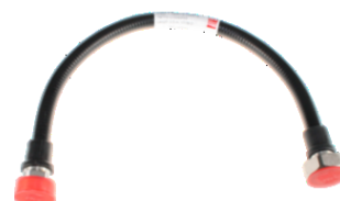
Picture shows 7M7FL12-0100FFP for illustration purpose

Radio Frequency Systems' CELLFLEX® Factory-Fit Jumpers feature specially designed connectors which are soldered-on in a strictly controlled industrial process to ensure industry leading performance for today's high-performance wireless systems. The connector design and manufacturing process has been optimized to produce premium VSWR and IM levels. Injection molded boots provide reliable and repeatable additional sealing level and strain relief. Our facilities produce and stock all popular lengths as required by the industry, and can deliver custom lengths with premium VSWR and IM levels on request.