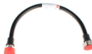
Picture shows 7M7FS12-0100FFP for illustration purpose

Radio Frequency Systems' CELLFLEX® Factory-Fit Jumpers feature specially designed connectors which are soldered-on in a strictly controlled industrial process to ensure industry leading performance for today's high-performance wireless systems. The connector design and manufacturing process has been optimized to produce premium VSWR and IM levels. Injection molded boots provide reliable and repeatable additional sealing level and strain relief. Our facilities produce and stock all popular lengths as required by the industry, and can deliver custom lengths with premium VSWR and IM levels on request.